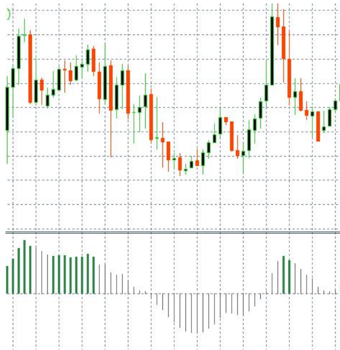
A "Long" (Buy) trade. Once again, see how the candles (Price) start with a bullish strenght, even when the retracement cycle didn't end. This is a good thing.