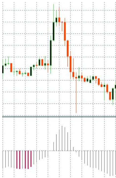
Another example, with a small retracement (with no colors).